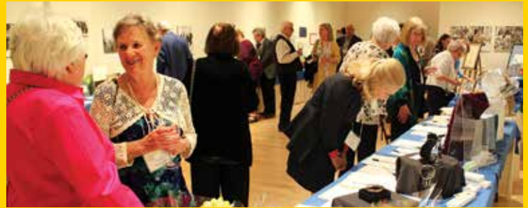
▲ We had many exciting items to bid on in our Spring Ting auction this year!