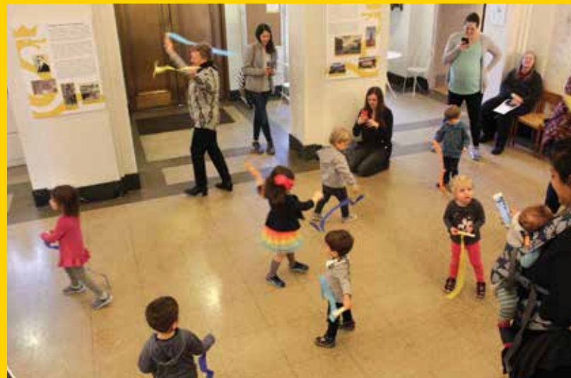
▲ Children dancing to ABBA in the grand hall at Toddler Time in February