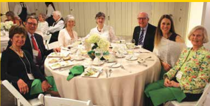
▲ Spring Ting guests enjoying a delicious dinner prepared by Jeffrey Miller Catering