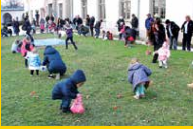
▲ How many can you find?! Easter egg hunt on the lawn in front of the museum

▼ Easter witch dress-up at Easter Family Fun Day in March