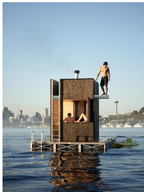
Floating sauna from GO'C Architecture and Design Studio, Seattle, WA.