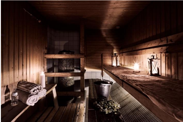
Interior of Sauna Hermanni, Helsinki, Finland.